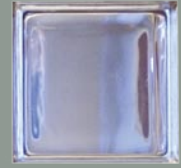
Clear Honor Block