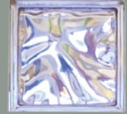
Wavy Honor Block