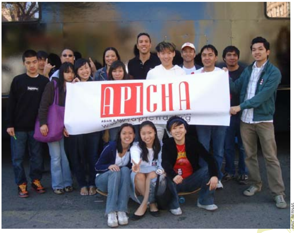
At the end of the day, it was well worth it. APICHA's health fair team posed in front of the mobile van marking another successful event at the Asian Pacific American Heritage Festival.

CTR staff worked tirelessly with the Coalition of Asian and Pacific Americans (CAPA), the organizer of the event, and the NYC Parks