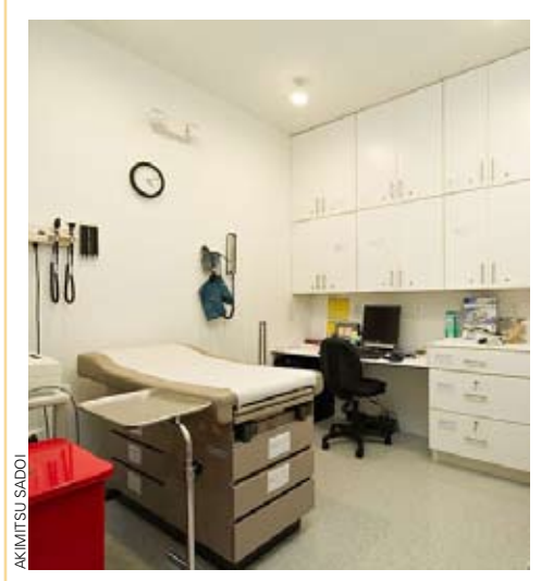
One of four newly outfitted exam rooms in the Health Care Services floor.

clinic offered health screenings (i.e. glucose and blood pressure). This event is a great example of how APICHA's programs are working closely together for the benefit of our communities. The event has been made possible by grants from CDC and the New York City Council Communities of Color Initiative.