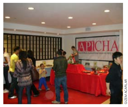
Guests enjoying scrumptious dishes prepared by staff and donated by generous sponsors.

In true APICHA fashion, food was front and center—quite literally. Banquet tables were placed