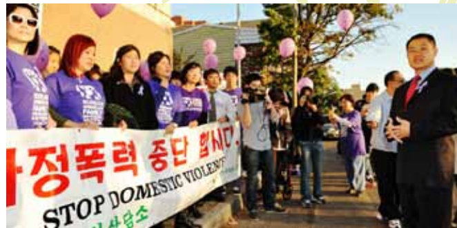
New York City Comptroller John Liu talks before the annual silent march against domestic violence in Queens.

The Women's Project peer educators of APICHA joined the Korean American Family Service Center (KAFSC) and many other local